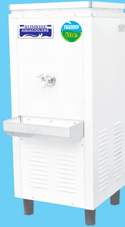
SS/PC 15/15 HCN