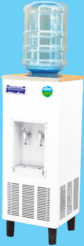
SS/PC 10/10 HC