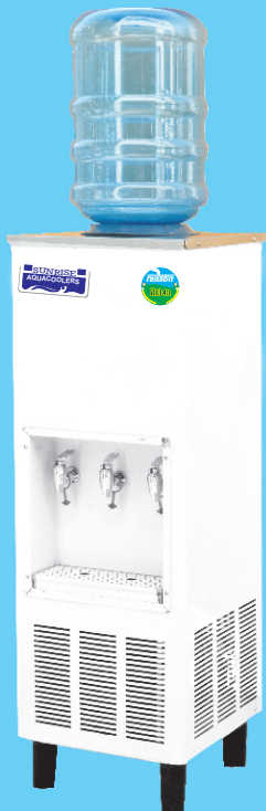
SS/PC 20/20 HCN